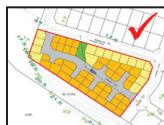
Garden Site - 58 erven