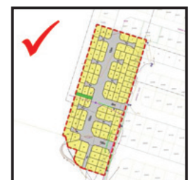
Mandela Square - 83 erven