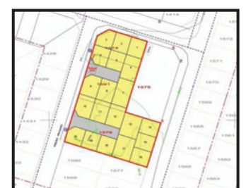
Service Site - 132 erven